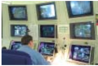
Control room at a pulp and paper mill.

Computerized sensors and state-of-the-art control equipment monitor each stage of the papermaking process. These controls allow mills to improve the quality of the paper produced by the continuous measurement and control of various parameters such as basis weight, brightness, caliper, color, moisture and opacity.