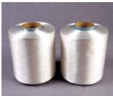
Spools of acetate filament yarn.

Another polymer, Ethyl cellulose is obtained from the treatment of wood pulp with alkali and is used in making tool handles, photographic film and football helmets.