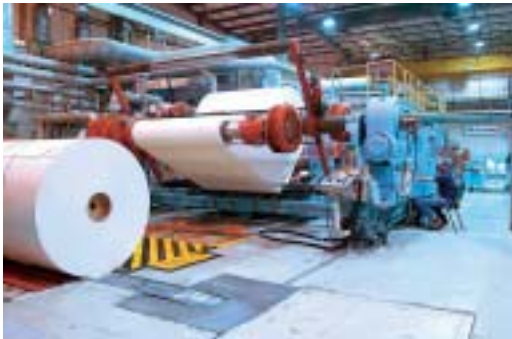
Paper machine in a modern paper mill.