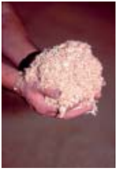
Wood Chips used in pulping.

The modern pulping process is remarkably efficient at producing raw materials for papermaking. There are three forms of pulping: chemical, mechanical and recycled.