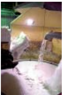
Recycled fiber being broken down in a pulp/paper mill.

Recycled paper is often made into the same grade of paper that it was originally. For example, most newspapers are made into new newspapers, corrugated cardboard boxes are made into new boxes, brown paper bags into new bags, and office paper into new office paper.