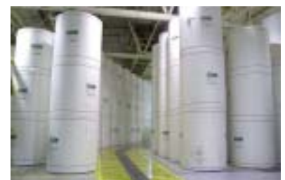
Rolls of finished paperboard.

Today's paper fiber comes principally from two sources, wood and recovered paper. Approximately 40 percent of today's paper fiber comes from harvested hardwood and softwood logs or pulpwood. The efficient recovery of waste wood from manufacturing processes and forest residues currently provides another 24 percent of the industry's raw material. Recovered paper is another important source of paper fiber. Thanks to curbside recycling programs in many communities, we recover over 45% of all paper used in America for recycling and reuse.