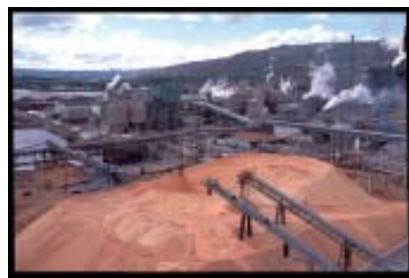
Sawdust being stored for use at a pulp/paper mill.

Bark is used as fuel in mills and is also a source of chemicals, resins, waxes, vitamins, plywood adhesives, plastic fillers, lacquers, and mulches.