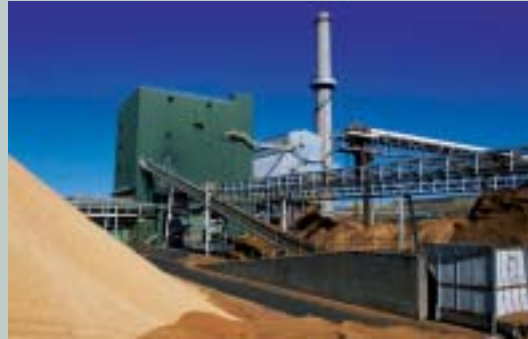
Power plant at a pulp/paper mill uses mill waste for energy.

The forest products industry is one of the country's most energy-intensive. But the forest and paper industry produces more than 41% of the nation's self-generated electricity through cogeneration. It also far outpaces all other manufacturing