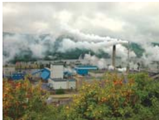
Thanks to environmental technology, most of the exhaust from mills is just water vapor.

Since 1990, the EPA confirms a 70 percent decrease in dioxin advisories downstream of pulp and paper mills. This is credited to the virtual elimination of dioxin discharges due to complete substitution of chlorine dioxide for chlorine gas in the first stage of chemical pulp bleaching—so called Elemental Chlorine-Free (ECF). Out of 2,618 total waterbody advisories in the U.S. only 11 are downstream of bleached chemical pulp and paper mills—less than one-half of one percent of the total.