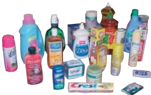
Common products containing turpentine-based chemicals

Tall oil is recovered from the condensed black cooking liquor. Once recovered, tall oil can be distilled into fatty acids and resins for applications in; asphalt & paving, coatings & paints, concrete, refinery co-products, mining, and textiles. Other typical applications include soaps, detergents, emulsifiers, rubber processing, epoxy additives, printing inks, plasticizers, metalworking, oil field chemicals, and ore flotation.